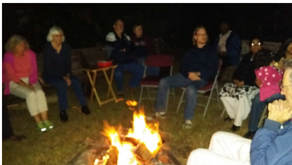
Campfire at Friday Seekers