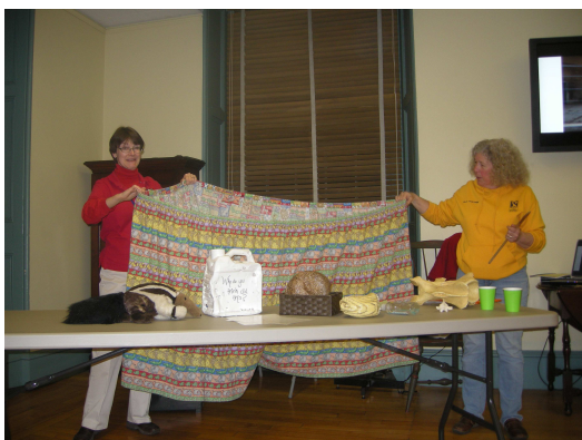
A pair of elephant shorts !