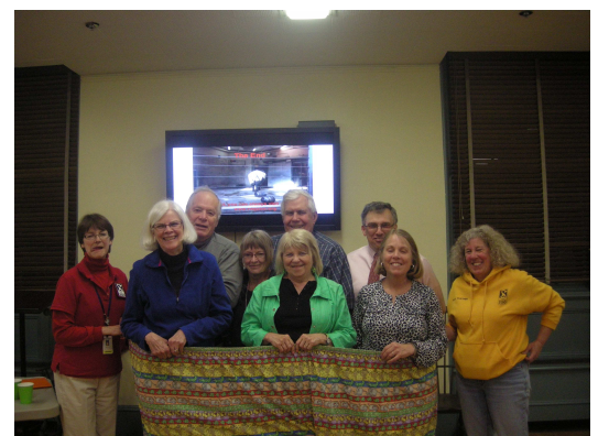
... and it's a fit!!