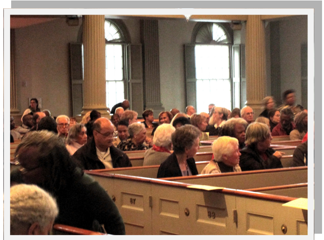
A "congregation" of nearly 200 attended the keynote sermon and program.