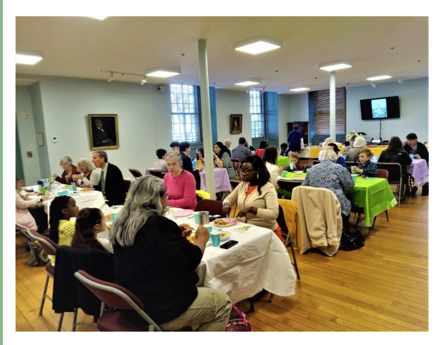
The breakfast came at 9:30 in the Fellowship Hall

Easter at FBCIA began with the traditional breakfast, followed by an Easter egg hunt by the children in the churchyard. Next came the worship service with special music in the auditorium.