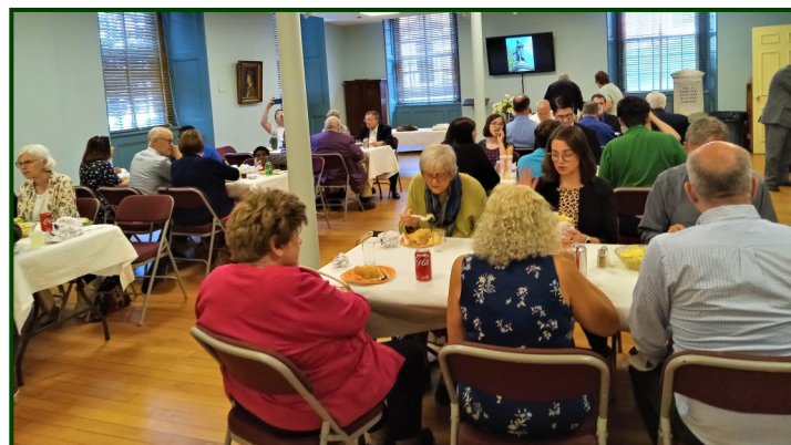
After worship, the lodge hosted the congregation to a luncheon in the Fellowship Hall.