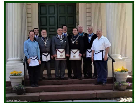
The members of the St. John's Lodge gathered for a group photo under the portico of the Meeting House.